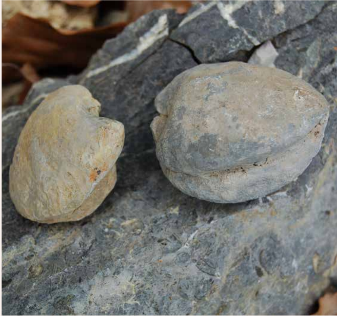
Shells Triadomegalodon idrianus , Upper Triassic beds, Knipajz Idrija UNESCO Global Geopark, Slovenia, www.geopark-idrija.si