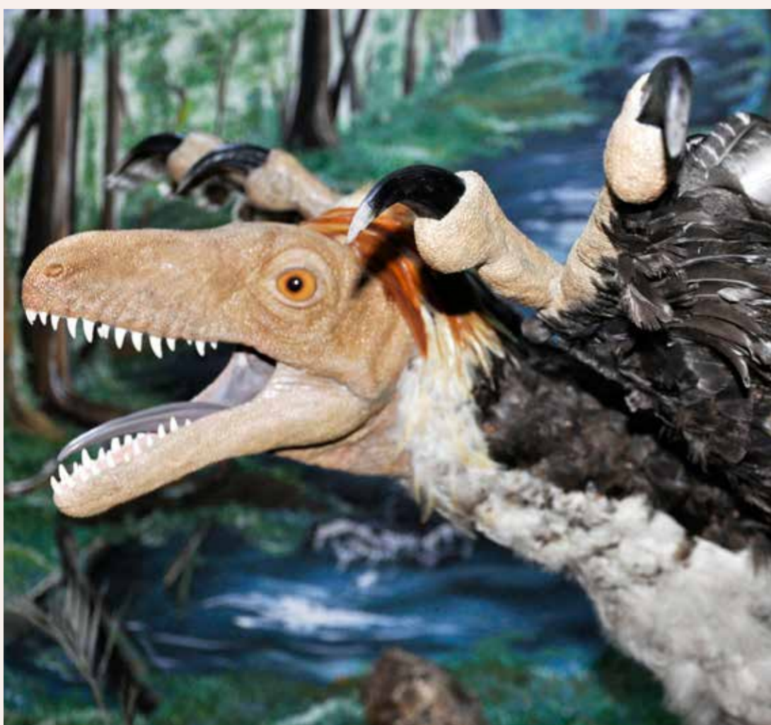
Reproduction of dwarf dinosaur Balaur bondoc , Late Cretaceous Hateg Country UNESCO Global Geopark, Romania, www.hategeoparc.ro