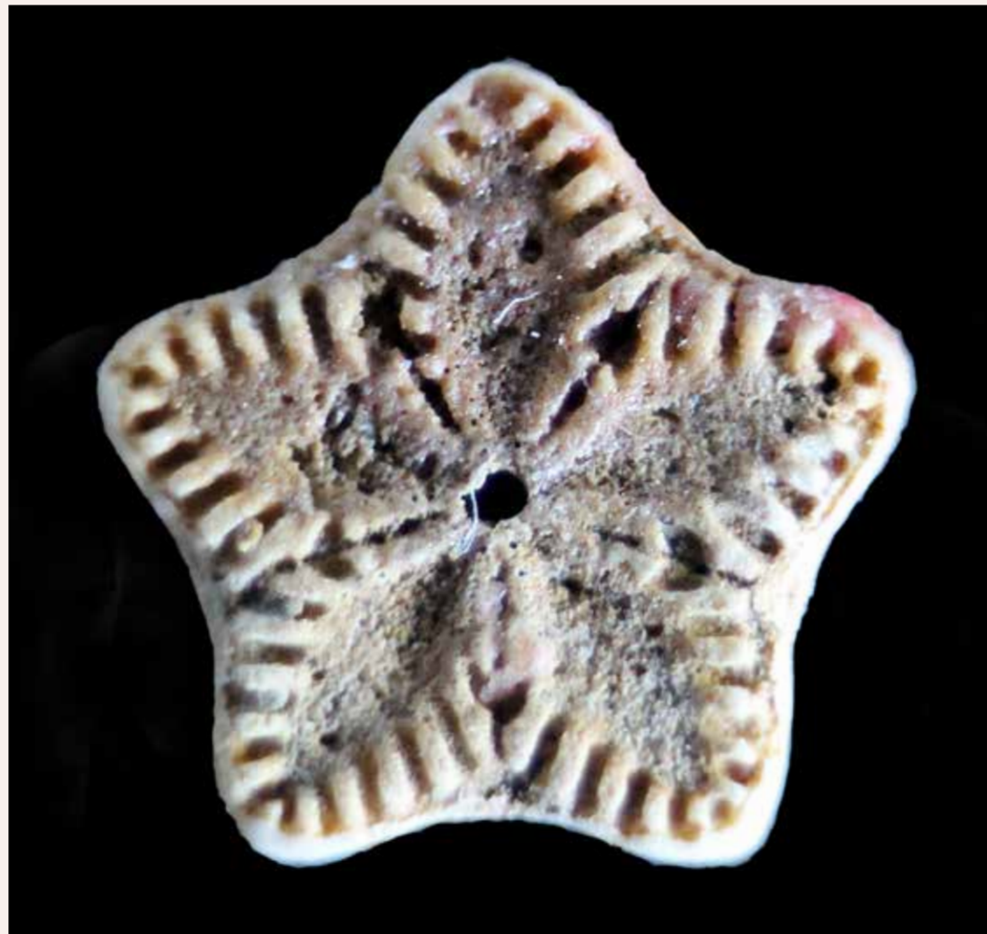
Crinoid Tyrolecrinus pectae , 0,4 cm, Upper Triassic beds, Helenski potok, Črna na Koroškem area, Karavanke-Karawanken UNESCO Global Geopark, Austria – Slovenia, www.geopark-karawanken.at