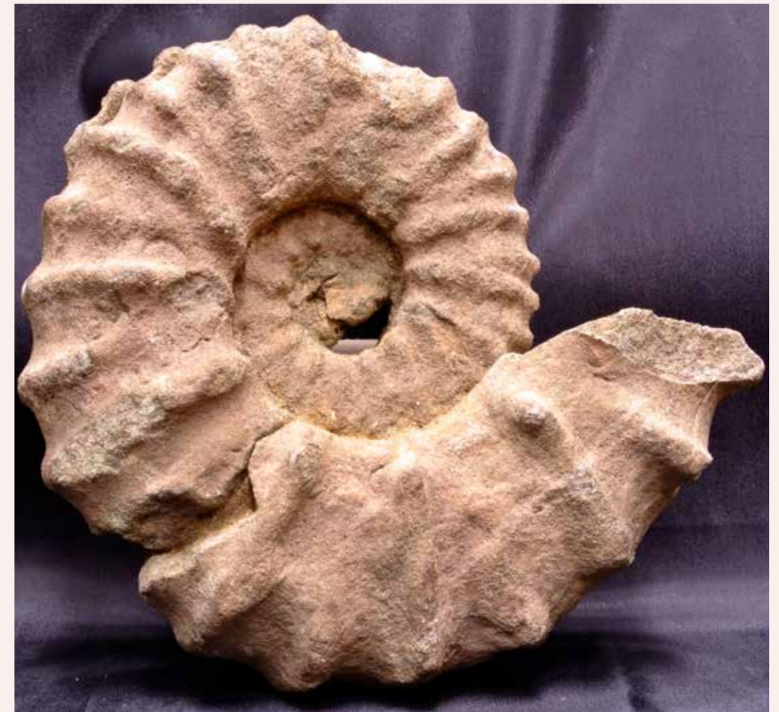
Fossil amonite, Cretaceous beds, Chrast Železne Hory geopark, Czech Republic, www.geoparkzh.cz