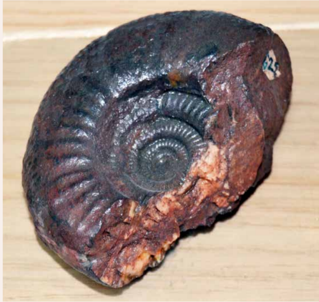
Amonite Procerites (P) procerus , Middle Jurassic, Greben Aspiring Geopark Djerdap, Serbia, www.npdjerdap.org