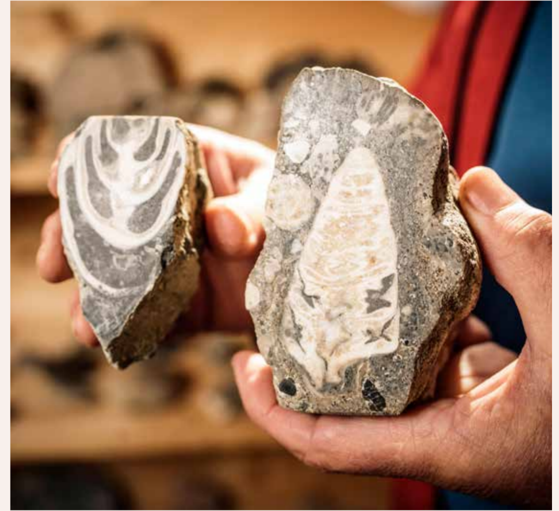
Trochactaeon sp. and on the right Nerine sp., GeoVillage, Gams Styrian Eisenwurzen UNESCO Global Geopark, Austria, www.eisenwurzen.com