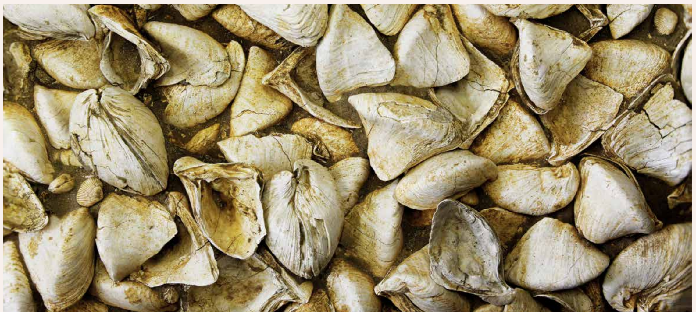
Shells Congeria unguicaprae , average size 8 cm, Late Miocene, Doba Bakony-Balaton UNESCO Global Geopark, Hungary, www.geopark.hu