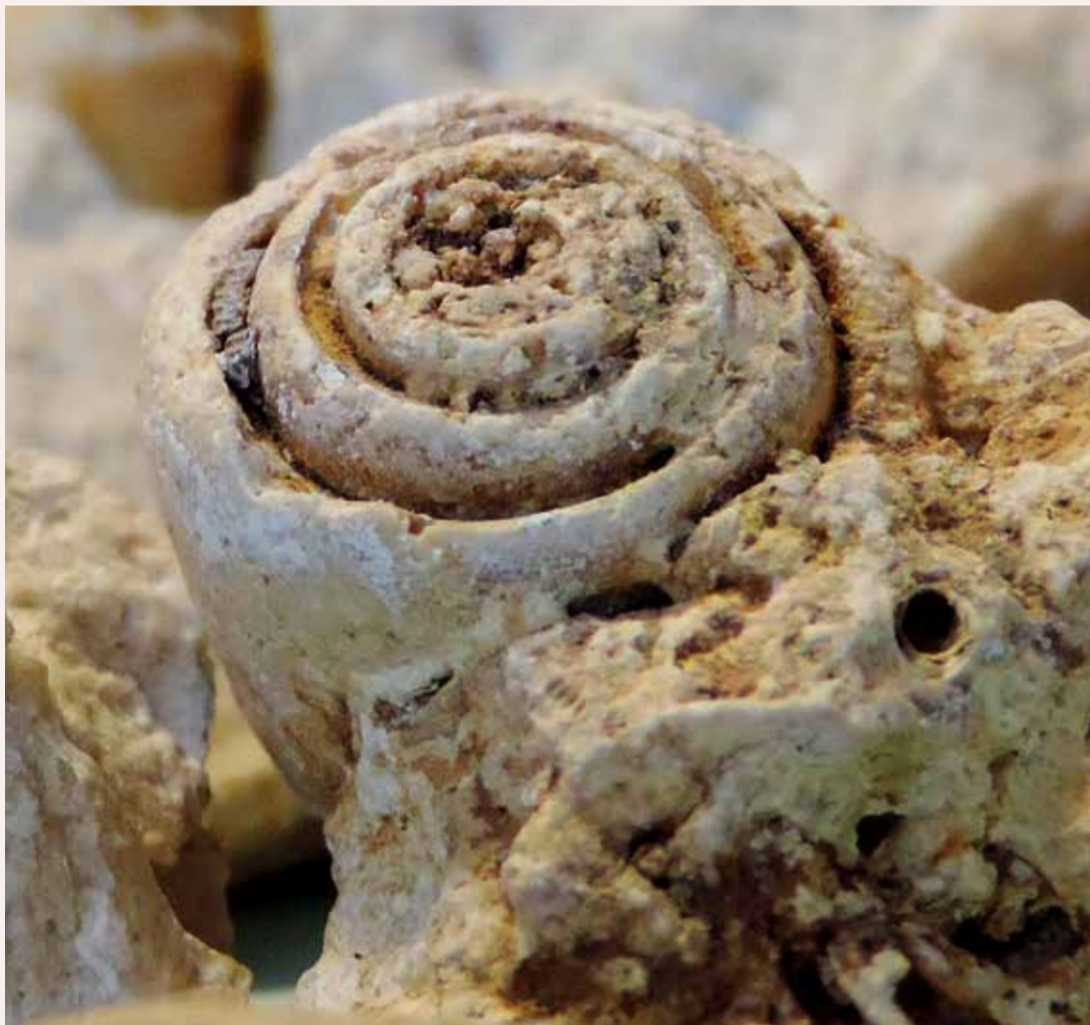
Gastropod, 4X, Miocene, »Panonian sea« Papuk UNESCO Global geopark, Croatia, www.pp-papuk.hr